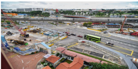
These moves will improve the quality of plans submitted to the Land Transport Authority