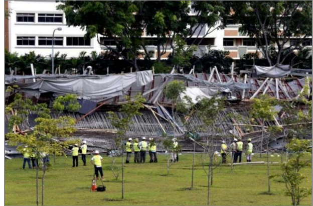
Collapse of bridge under construction during concrete pour