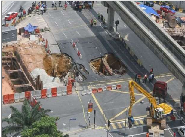
Sinkhole on existing road due to excavation works