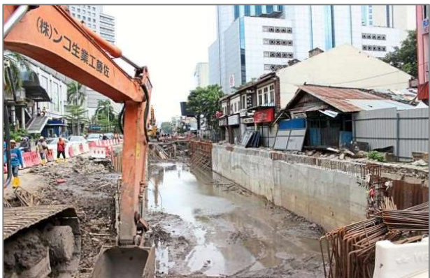
Flooding to third party property due to works