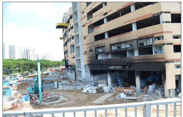
Fire damage to building under construction